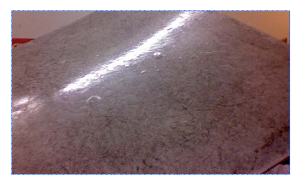
Fig.6 The aspect of dried Hemp mat SMC